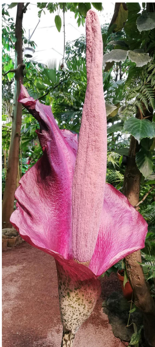
Amorphophallus dunnii Tutcher